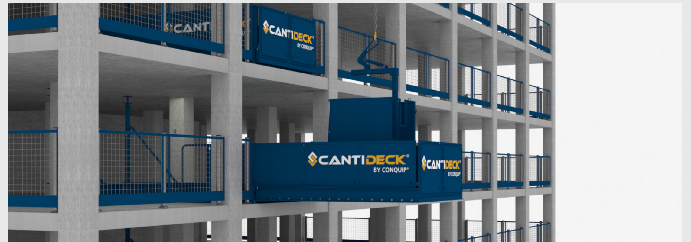
04 / CantiDeck makes building loadout look easy.