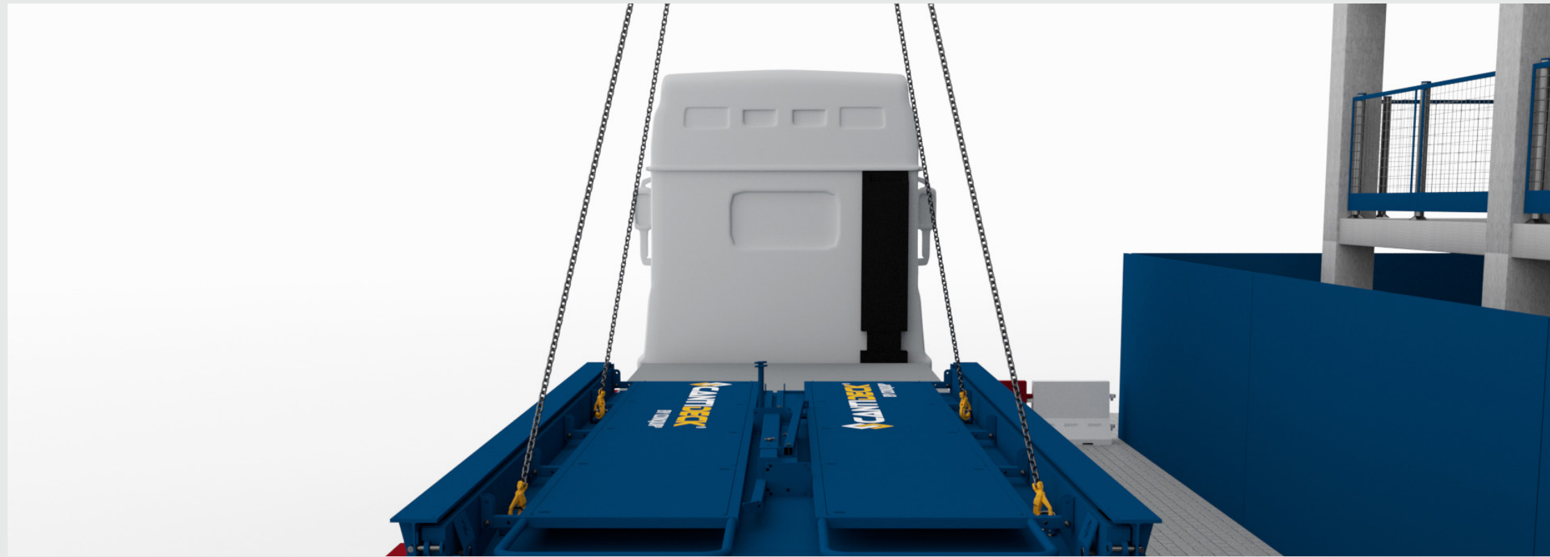
01 / Deck is crane lifted off the back of the truck.