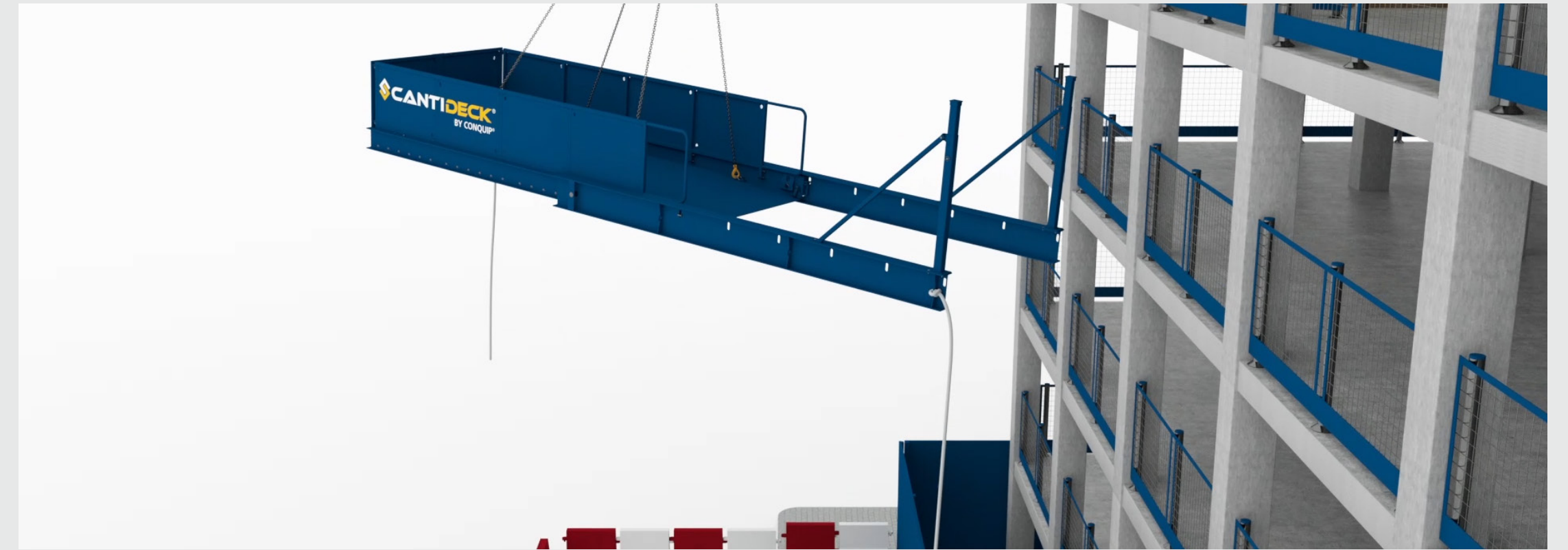
02 / Platform is lifted into position.