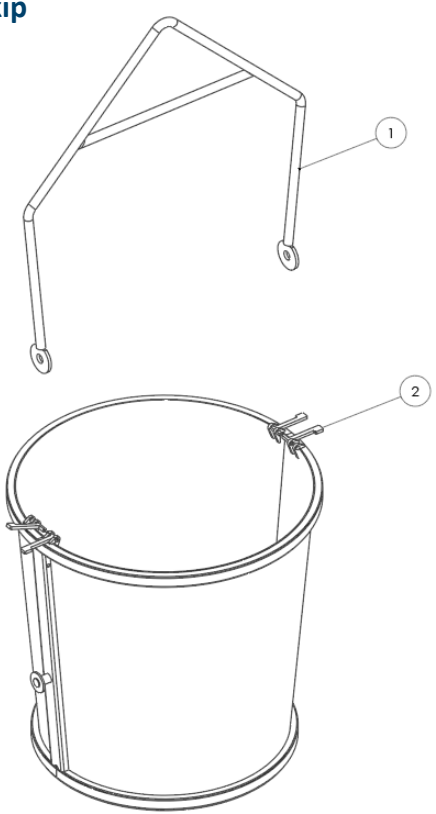
NOTE: These parts are for this model, they may differ for previous versions. Please contact Conquip with any queries.